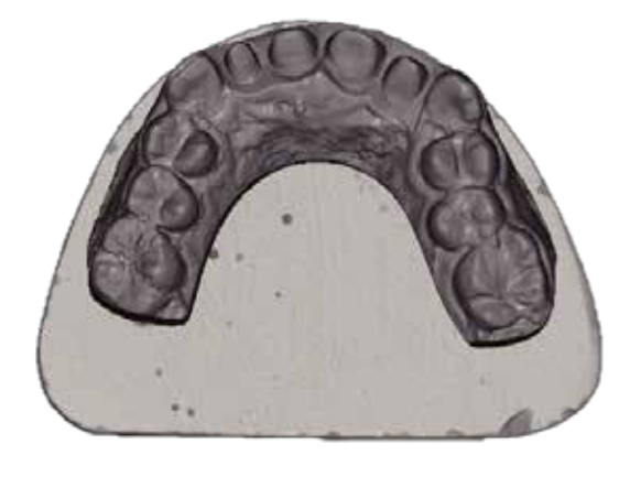
UP400 scan data